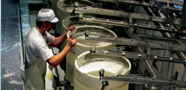
This dairy worker checks the cream churns