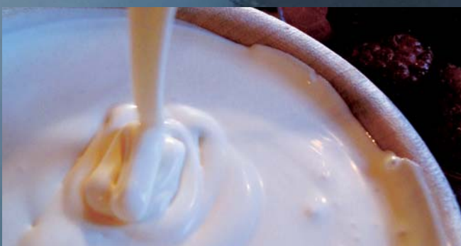
Thick, rich and not good for dieters: Gruyères' famous crème double de la Gruyère